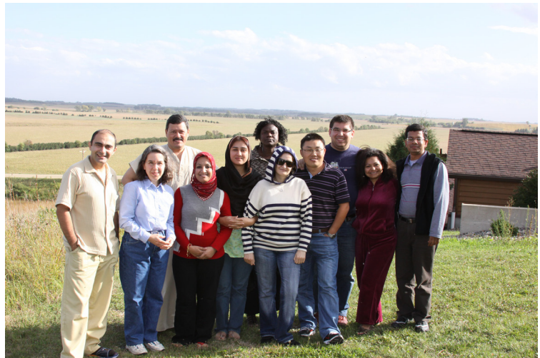
Fall Planning Retreat at Shalom Hill Farm in Windom