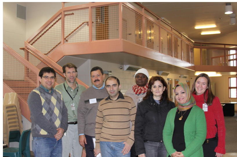
Hennepin County Juvenile Detention Center Visit in December