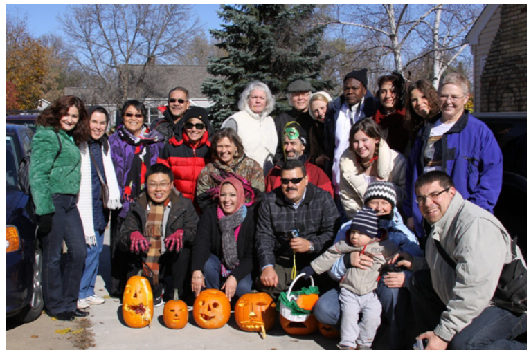
Halloween Brunch with Host Families