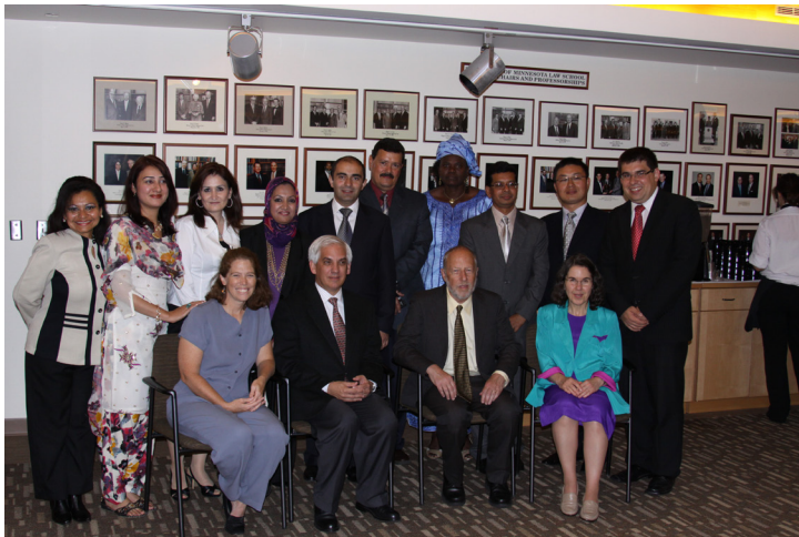
Welcome Reception in September