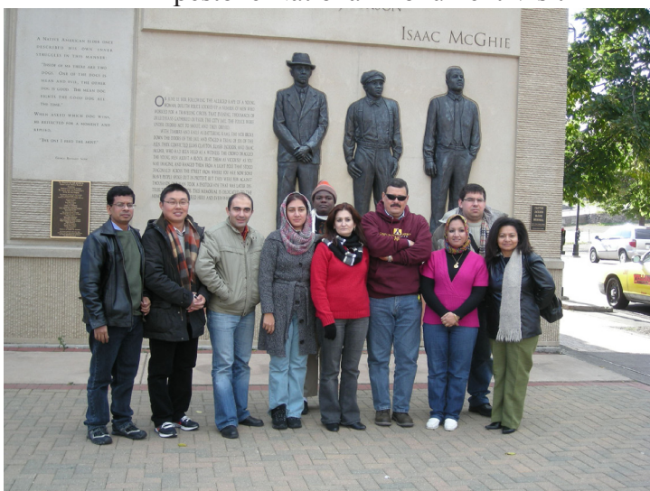
Duluth Networking Visit in October