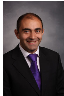
Mr. Edmon Marukyan Armenia