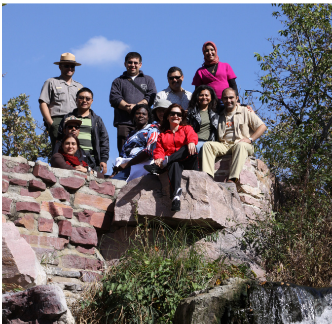
Pipestone National Monument Visit